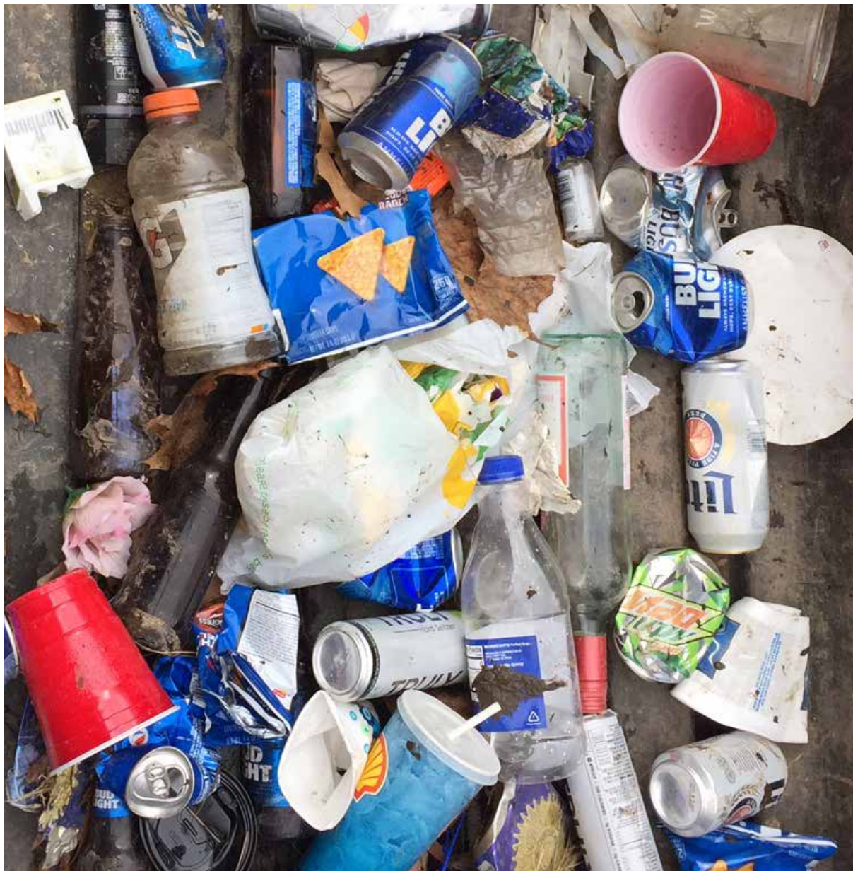
Garbage picked up along Vermont Church Road

If you would like to be part of a more organized effort of fellow volunteers, reach out to Town of Vermont Patrolman, Jack Schulenberg, 608-767-2457.