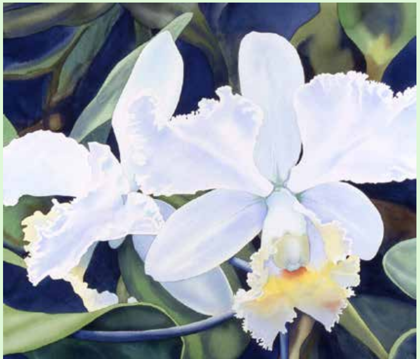
Opulent Orchids, Watercolor, Tamlyn Akins